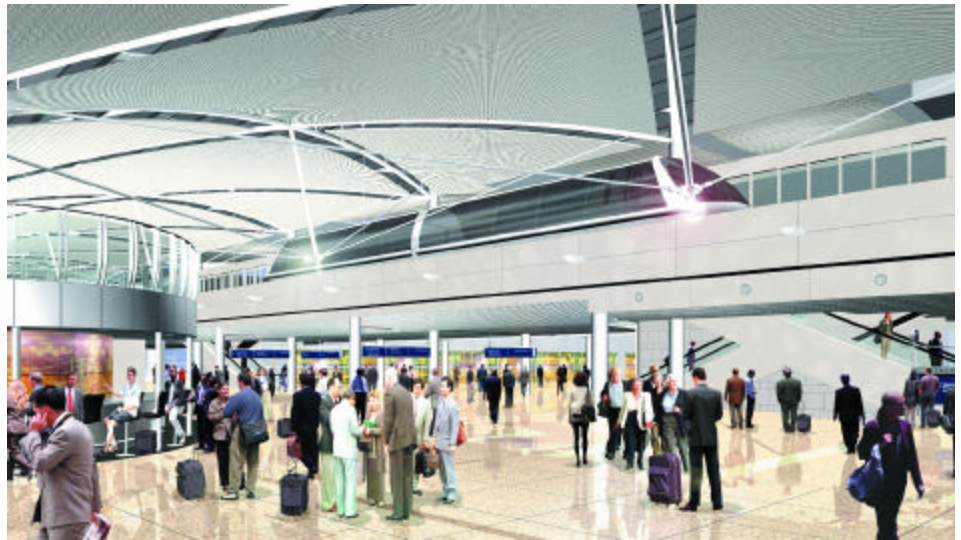
Depiction of the mile-long Detroit Midfield Terminal planned for completion in 2001