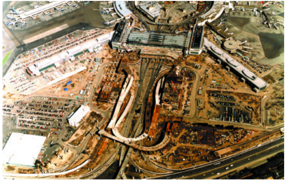
Aerial view of the San Francisco International Airport's new international terminal, due to open in 2000.

Currently, Boarding Area A mechanical and electrical installation is 99 percent complete. Mechanical installation in Boarding Area G and the South Shoulder area is more than 90 percent complete. North Shoulder mechanical engineering is finished with only the sway brace design left to install. Mechanical engineering for the outbound and inbound terminals is almost complete with the conveyor, catwalk, and support models finished. In addition, the electrical engineering motor control panel design is complete. As BAE's engineers complete work in San